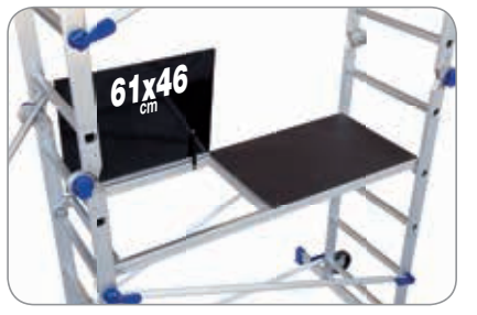
Aluminium structure. Non-slip and waterproof surface. Melamine Eurodeck wood