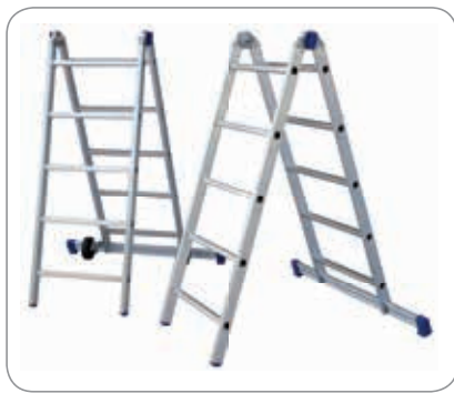
2 Double ladders

It means: FSC Norm - Environment respect