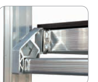
Strong aluminium hooks, welded to the platform.